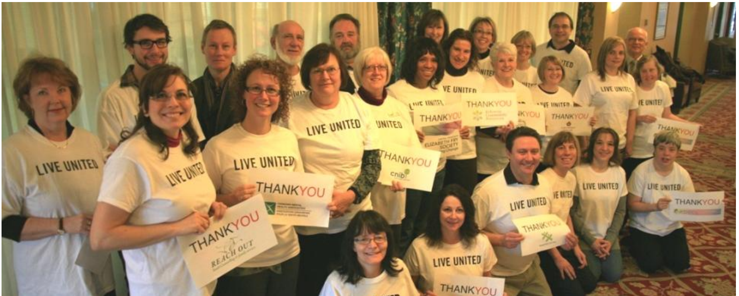
Photo of United Way Community Partners

Change starts with a gift to your community through United Way...