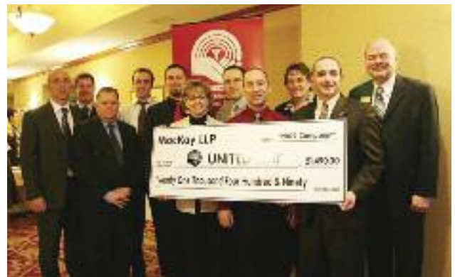
Donation to the United Way Campaign in 2009.

MacKay LLP Kelowna... a worthy recipient of the 2009 Corporate Community of the Year Award and an example for other businesses to follow in supporting their community.